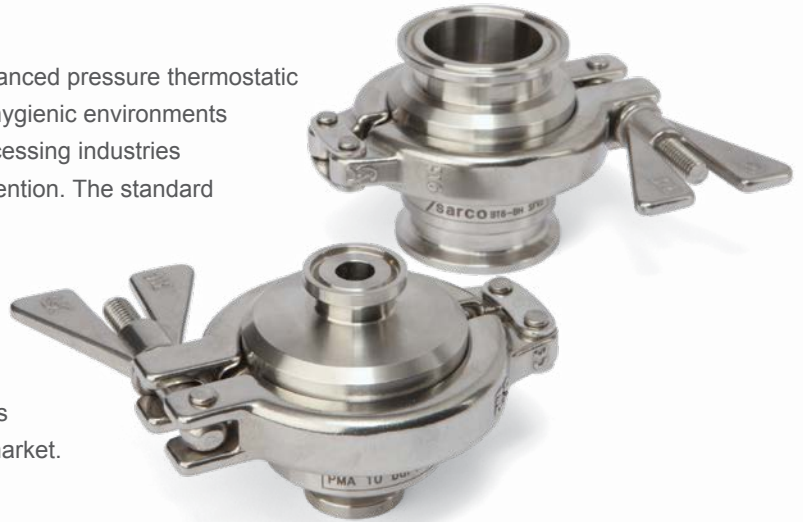
Temperature control @ nominal 1 barg

The Spirax Sarco BT6-B is a high specification sanitary balanced pressure thermostatic steam trap that has been developed specifically for use in hygienic environments such as the pharmaceutical, biotechnological and food processing industries to remove condensate with the minimum of condensate retention. The standard element is extremely sensitive to changes in condensate temperature and is designed to open with a minimum of sub-cooling, typically less than 2°C from steam saturation temperature at pressures below 2.5 barg. Its unique design, with enhanced features, ensures the BT6-B is effective and economical and exceeds the capabilities of other models currently available on the market.