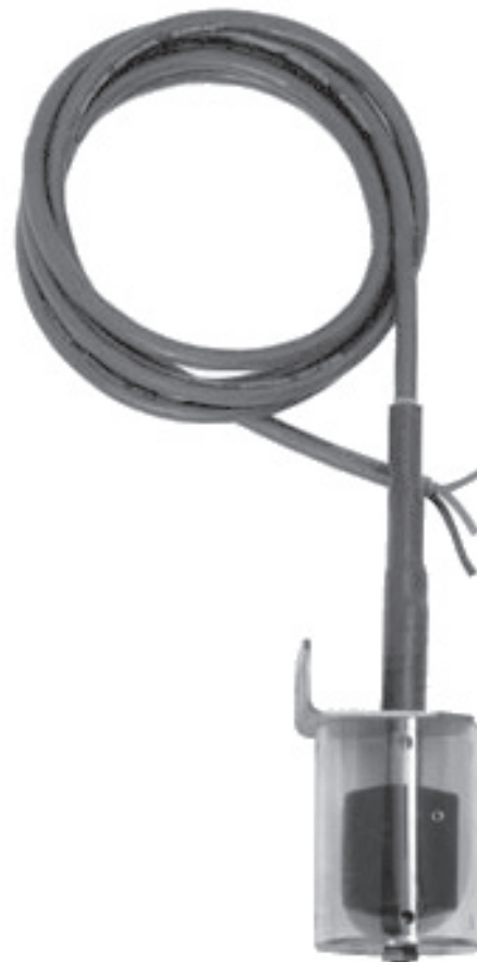
Type TOR S with Perspex protection, Buna N float, NFO cable

NFO Cable Sealed for immersing and resistant to contact with sea water, traces of paint, thinners and fuels.