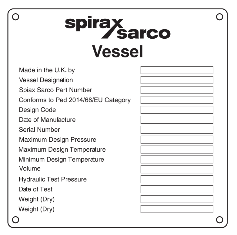
Fig. 2 Typical FV type flash vessel name-plate details

Note: These vessels will withstand full vacuum conditions.