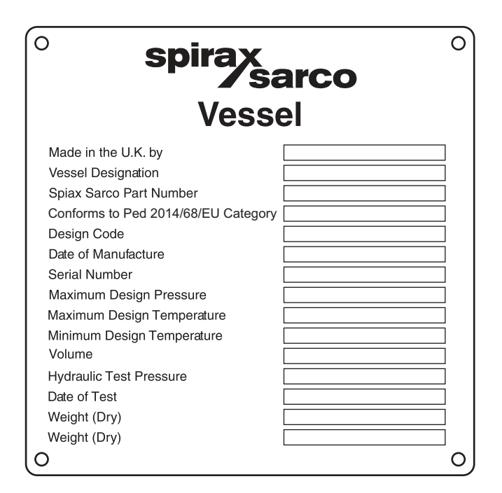
Fig. 1 Typical name-plate details